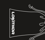
Accessories Storage Bag